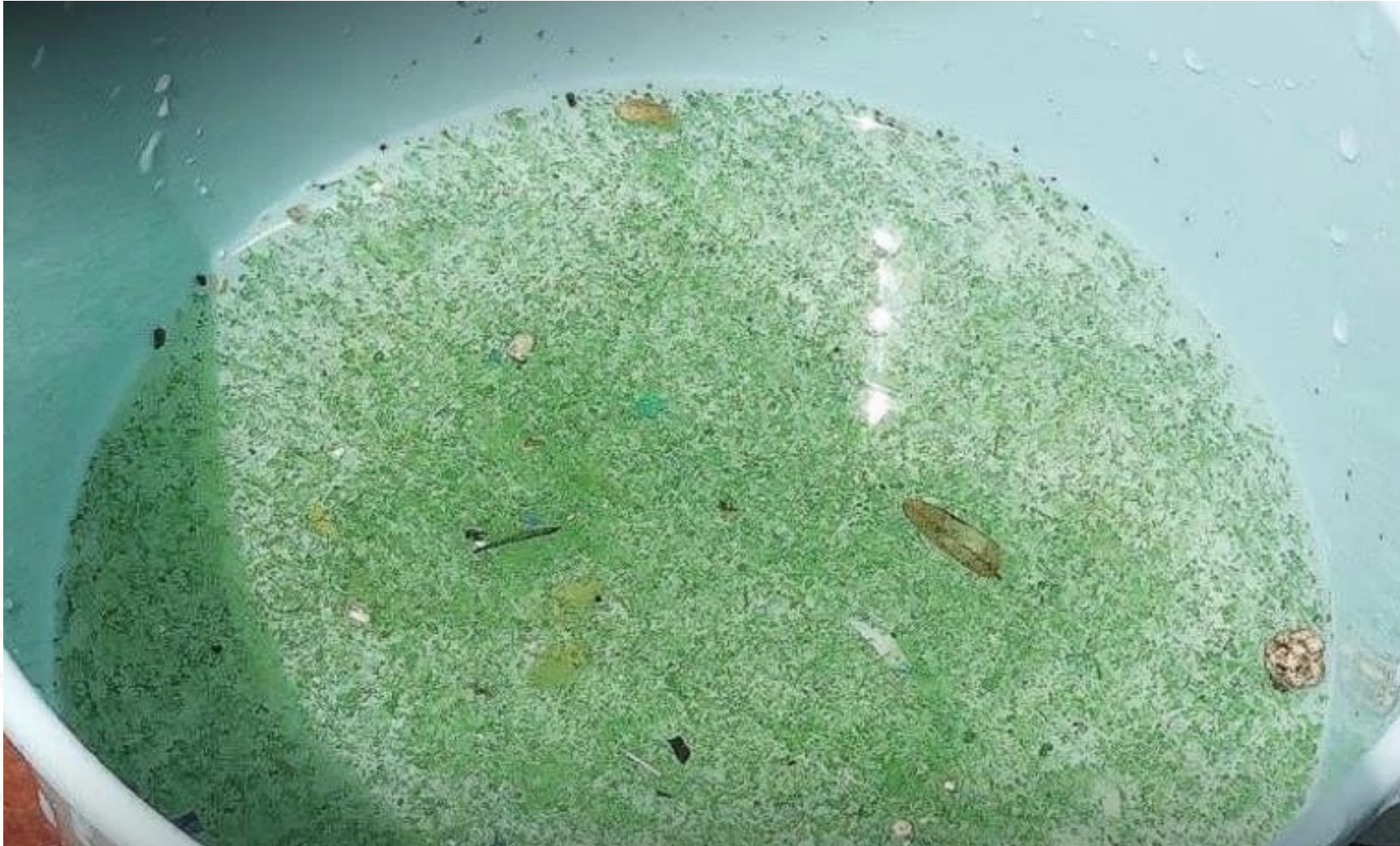
Water sample from Chaopraya river, Bangkok (August 2023)