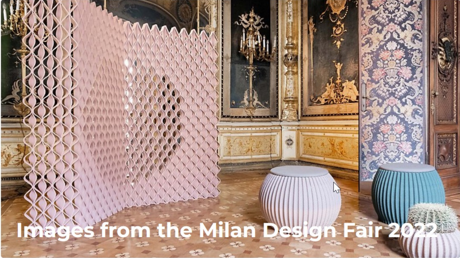
Images from the Milan Design Fair 2022